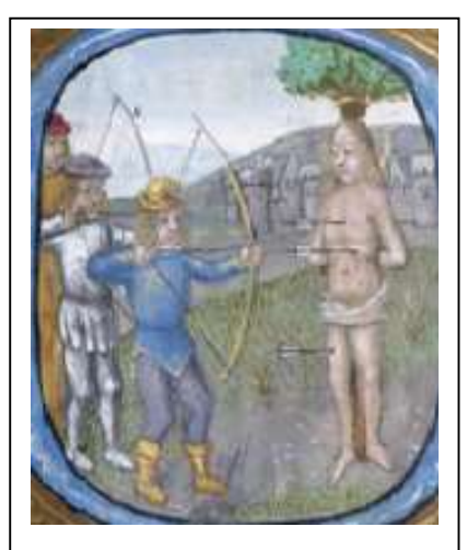
Hezekiah's early experiments in Chinese acupuncture proved too controversial for the village.