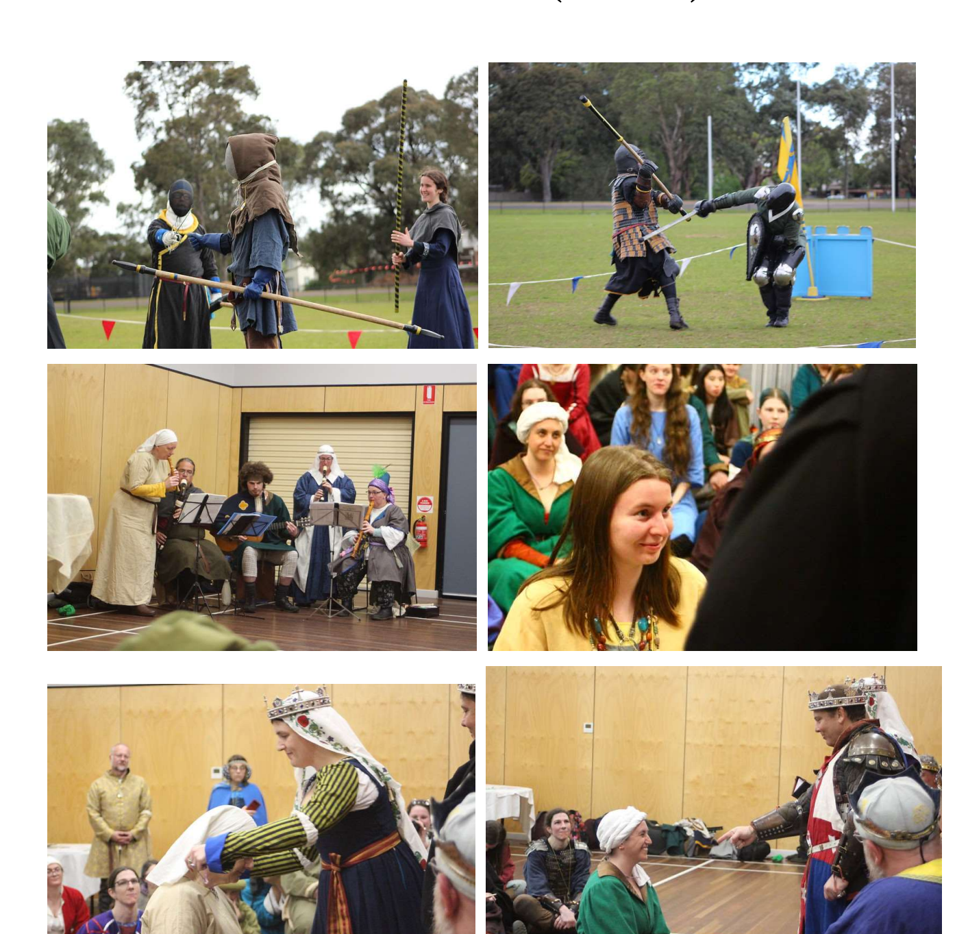
from the Royal Visit to Krae Glas. We sang, we danced, we fought and made merry.